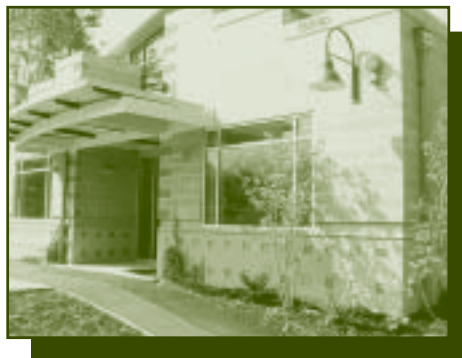
Shuttle Operations Center now open at the NE 40th Street Transit Center.

January 2003. This building will house a bicycle station, the Greater Redmond Transportation Management Association (GRTMA), Redmond police outpost and driver restrooms. For more details, log on to: www.soundtransit.org/stplans/eastling/overlake/Overlake.htm .